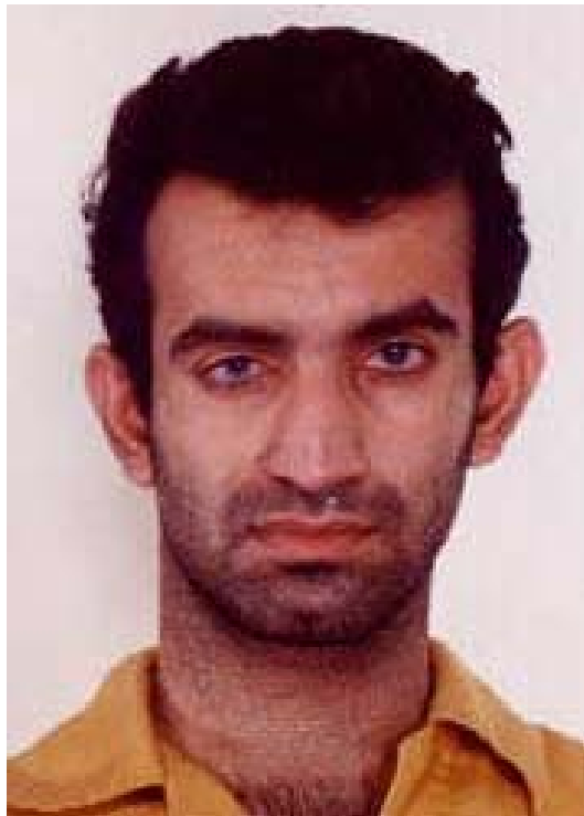
RAMZI YOUSEF (A.K.A. ABDUL BASIT)