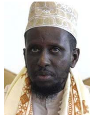
Shaykh Sharif Ahmed

Yet, it should be emphasized here that not all of the “leading lights” behind the ICU adopted the same hardline, transnational approach to their activities. Shaykh Sharif Shaykh Ahmad served as chairman of the “Supreme Islamic Court” in Somalia and was, at one