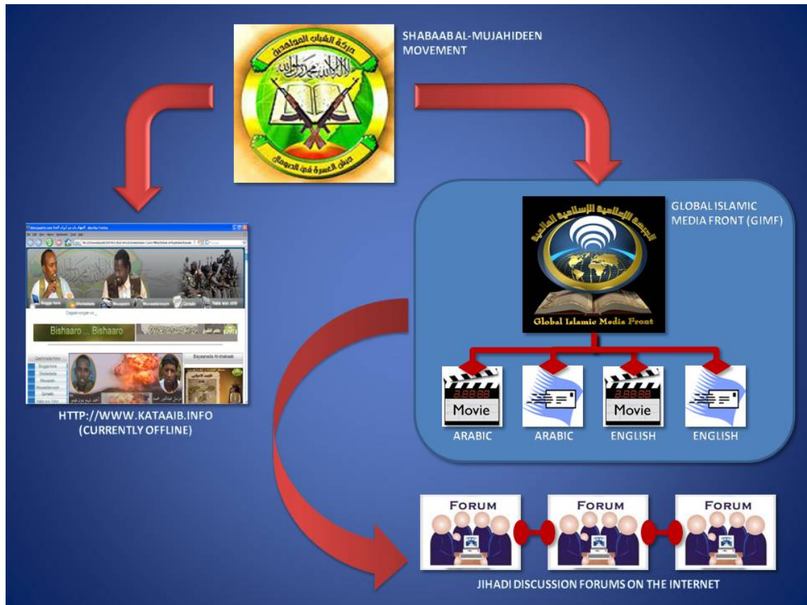
Chart: The Shabaab al-Mujahideen Movement's Media and Propaganda Pipeline

“We thank the brothers who are putting up their efforts in the Jihad media generally, and our brothers at GIMF especially who played an important and key role in making the Somalia jihad prominent and adopted our publications and statements and covered our operations. For before the emergence of the jihad media, the eyes and ears of many Muslims were fixed on the crusader government media which distorts the image of jihad... From this darkness emerged the jihadi media which surged forward and forced our enemies to await the statements of the mujahideen in the forums and the jihadi websites... There are many men whom Allah has guided to jihad thanks to these anonymous brothers on the Internet and much good news reaches us through these brothers—of whom we know nothing other than we are joined by the bonds of faith, worship, and jihad.” 244