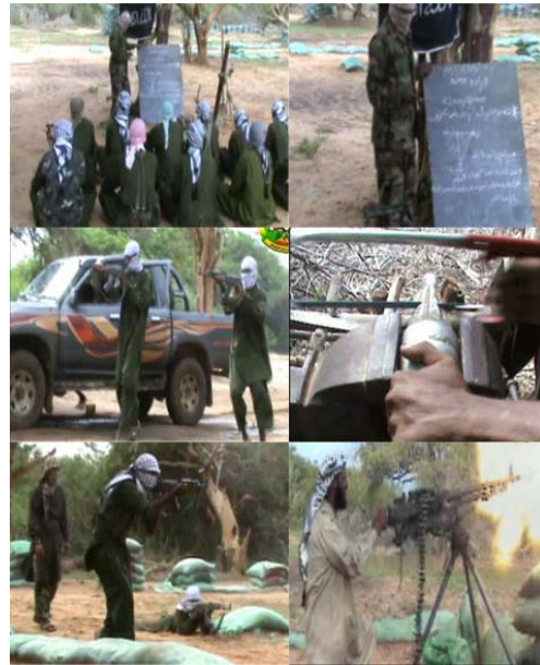
Scenes from a Shabaab al-Mujahideen Training Camp in Somalia

“Here are the training camps in Somalia and elsewhere... that have opened their doors so that you can join them. So be truthful with Allah and answer the call of jihad and prefer the lasting over the perishing, and the next life over the present life... O’ Muslim youth everywhere, don’t forget the calls of your brothers in Somalia—as if [one could]—they are repeating all the time. O’ immigrants! O’ immigrants! Will anyone respond? What are you waiting for, if you do not wage jihad now... when will you wage jihad? ...So likewise I say, O’ people of Kenya and Tanzania, and Nigeria and Uganda and Chad! Will you not take your share of the jihad? Will you not rush to the help of your brothers in the Army of Distress? And we are waiting for the reinforcements from Sudan and Yemen of wisdom and faith.” 182