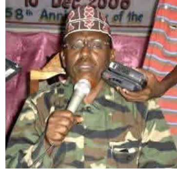
Shaykh Hassan Aweys

alongside him and serve as his trusted lieutenants within the AIAI. Perhaps the single most important commander recruited by Aweys at this stage was Aden Hashi Farah Ayrow, otherwise known as "Abu Muhsen al-Ansari." Ayrow had grown up in a remote valley of Somalia, where he spent most of his childhood. Later during his youth, Ayrow's father moved the family to the city of Mogadishu, where he enrolled his son in a local school for Quranic studies. Showing promise with his memorization of the Quran, Ayrow went on to study Islamic Shariah and jurisprudence at the Be'er al-Hind mosque in Mogadishu, "taking on the responsibility of spreading the faith among the Somali people, and defending the religion of Islam when the country was under the thumb of the Shiite government of Siad Barre,