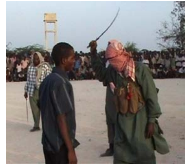
Shabaab fighters enforce the Shariah penalty for adultery in Mogadishu, March '09

“Praise be to Allah, most of the cities in southern Somalia are in the control of the mujahideen... There are no traces of the enemy or any other apostates like them anywhere, other than a few spots inside the capital and in the city of Baidoa. As far as other areas in the south are concerned, they are also in the hands of the mujahideen... The Shariah Courts are open, and there are no other courts besides the Shariah and the Islamic courts. There are no other courts, praise be to Allah. The book of Allah is the ruling authority amongst the people. It is also well-known that any tape with songs [on it] is forbidden and music is not allowed. You cannot hear even one sound which is not approved by almighty Allah... Moreover, most recently, during the month of Dhul Hijjah [December 2008], following holiday prayers, our mujahideen completed the destruction of tombs and graves that were being worshipped instead of almighty Allah. They destroyed more than 150 temples. I do not refer to them as ‘cemeteries’, but rather ‘temples’, which are being worshipped instead of almighty Allah... whose messenger, may peace be upon him, ordered this—for us to destroy the tombs and the graves... You do not see any woman on the streets who is not wearing a legal hijab, and you cannot see any part of the female body... Praise be to Allah, we have such a life here, that I doubt there is a better one to be found anywhere on earth.” 153