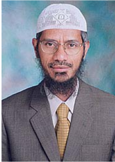
Zakir Naik

As stated earlier in this report, Zazi attended a mosque in Flushing that was split between supporters of Al-Qaida and the Taliban and those who did not support them. The debates would have exposed Zazi and other young worshipers to various perspectives, including the viewpoints of those who supported Al-Qaida.