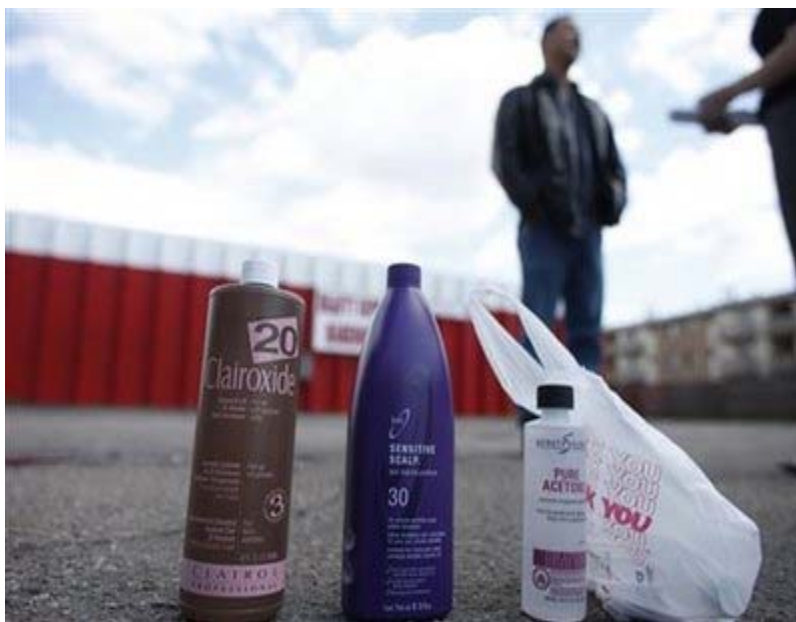
Some examples of the items purchased by Zazi

On August 28, 2009, Zazi returned to Beauty Supply Warehouse to purchase 12 32-ounce bottles of “Ms. K Liquid 40 Volume,” another hydrogen peroxide-based product. 69